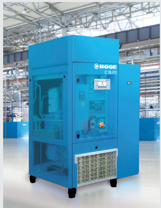
Optimal features and yet compact: the C 16 FD with integrated refrigerant dryer